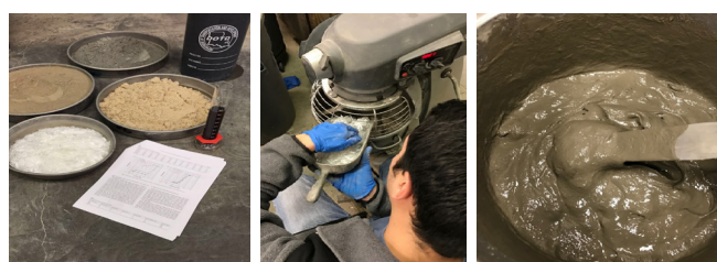
Figure 2: ECC Production at LSU Implementing Local Ingredients

ECCs, also known as ductile or bendable concrete, are a special type of high performance fiber-reinforced cementitious composites, that are micromechanically designed to exhibit metal-like ductility at relatively low fiber content (Figure 1). In contrast to traditional concrete, ECCs can undergo substantial amounts of deformation -- 100 to 500 times that of regular concrete in tension -- through a controlled process of multiple micro-cracking called "pseudo strain-hardening." Because of their unique properties, ECCs have been proposed as a superior material for repair and construction of transportation