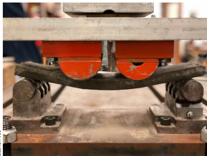
Figure 1: Highly Ductile ECC Material Developed at Louisiana State University

At LSU, our research team aims to accelerate the implementation of ductile concrete in the region's transportation infrastructure by developing cost-effective ECC