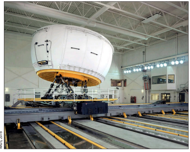
The NADS high fidelity driving simulator is owned by USDOT NHTSA and operated by the University of Iowa.

USDOT's National Highway Traffic Safety Administration (NHTSA) recently adopted the Society of Automotive Engineers' levels for automated driving systems, which range from complete driver control (Level 0) to full autonomy (Level 5). The project sought to study transfers of control between the driver and automated vehicles at conditional, or Level 3, automation. At this level drivers can shift both the physical and mental aspects of driving to the automated driving system but can still intervene if necessary.