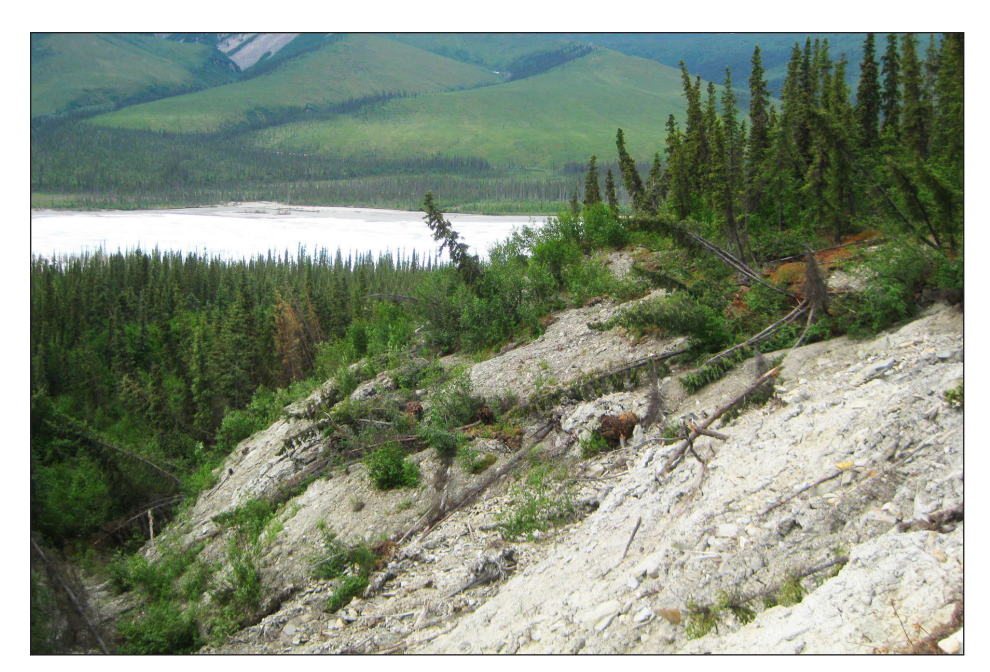
Trees have been slowly ripped from their roots, toppled, and eventually consumed by the slowly moving giant mass. Pictured: view of left flank of "FDL-A."

seed grant from Alaska EPSCoR³ to measure FDL-A's movement. This preliminary study resulted in the first publication on FDLs and established awareness of the current conditions and movement. The team had several goals: determine FDL-A's soil and bedrock profile; assess its thickness and stratigraphy; and install instruments and a weather station for measuring local weather, temperature, water pressure, and slope movement. They found that FDL-A was "fairly homogenous, consisting of silty sand with gravel." They drilled multiple borings and returned to conduct manual measurements and download meteorological data. On later trips, they also placed a series of GPS markers, enabling them to monitor FDL-A's biweekly movement. They have realized a variety of data, movement, and