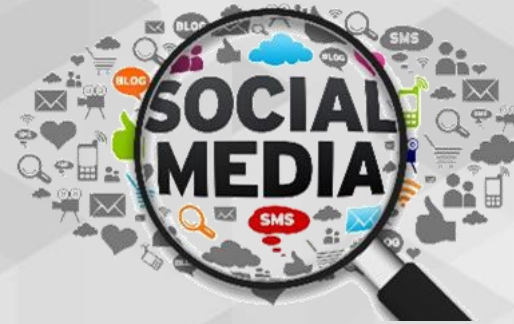
Social Media Data