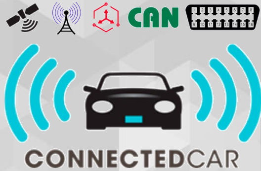
Connected Vehicle Data