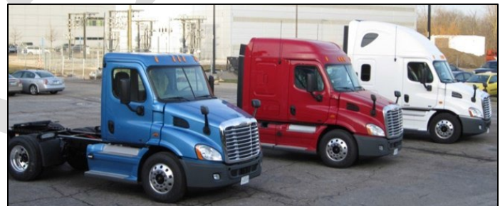
The three trucks FMCSA has acquired are 2012 Freightliner Cascadias, previously used in the Connected Vehicle Safety Pilot and other NHTSA-sponsored programs.

Objectives and Activities: FMCSA recently repurposed three Class 8 tractors (shown right) that were surplus NHTSA equipment to be used as test vehicles for truck platoon and automated CMV evaluations at the U.S. Army's Aberdeen Test Center (ATC). In FY 2019, FMCSA will partner with FHWA and the U.S. Department of Energy to conduct platooning and automated CMV test track evaluations at the ATC. With its partners, the Agency will perform numerous safety evaluations,