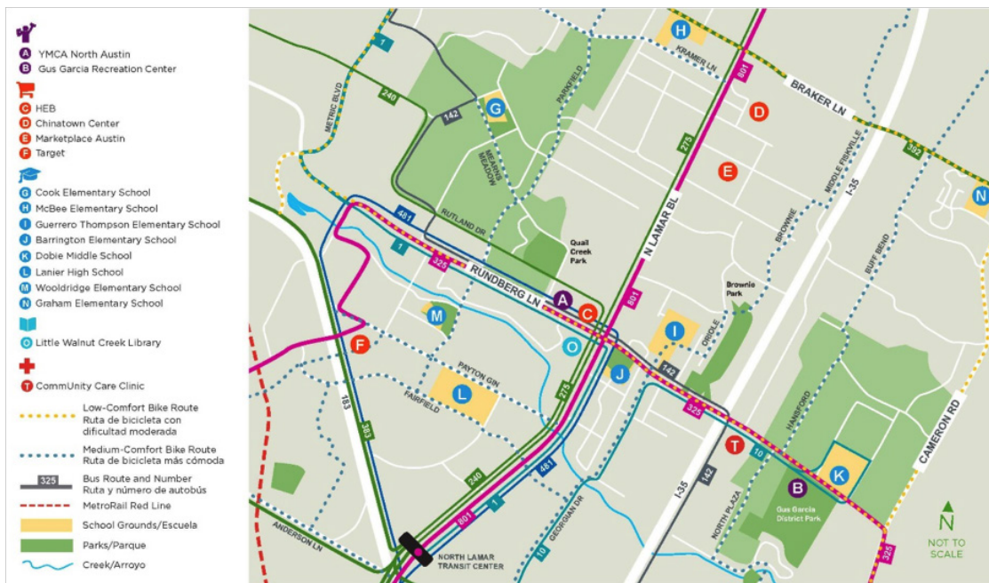
Walk, bike, and roll map with bike routes and bus routes serving the Rundberg neighborhood.