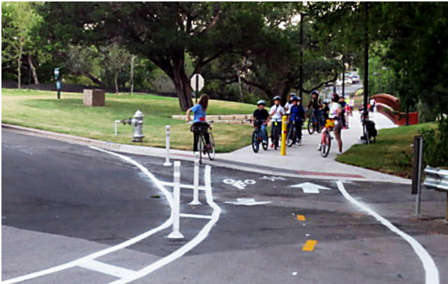
A separated bike lane connecting to an off-street trail in Austin.

Austin plans to issue a Mayors' Challenge Final Report after the Challenge officially ends and will continue to use the Mayors' Challenge branding to maintain momentum on new and existing initiatives.