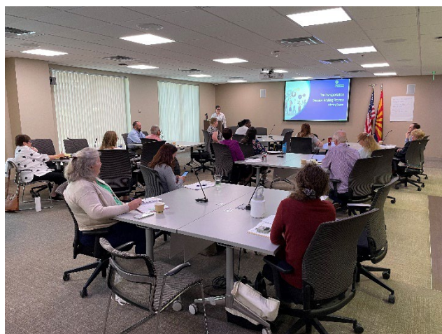
COMMUNITY LEADERS & MEMBERS OF THE PUBLIC LEARNING ABOUT THE TRANSPORTATION DECISION- MAKING PROCESS

Community leaders/members of the public attended a session that introduced the five steps of the transportation decision-making process – plan, fund, design, build, and maintain – and ways to be involved in each. Participants played an interactive game that helped them understand how everyone experiences the transportation system differently. In the afternoon, community leaders/members of the public participants explored how to navigate common transportation scenarios, such as asserting needs in a road project, adding or moving a bus stop, becoming involved with an airport runway project, and making a rail crossing work for their community. Participants discussed who to contact, when to get involved, what information they need to know, and what they need to consider.