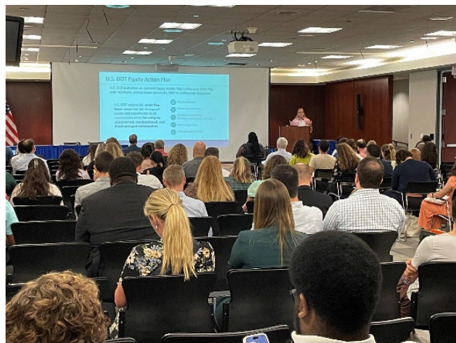
FHWA SENIOR EXECUTIVE PRESENTING ON THE TRANSPORTATION DECISION-MAKING PROCESS & ADDRESSING CRITICAL GAPS

Following welcome remarks and a presentation on making equitable transportation decisions, Transportation professionals and community leaders/members of the public each morning and afternoon breakout sessions relevant to their groups. Transportation professionals attended a session focused on effective ways to deliver public involvement and building organizational capacity to meaningfully engage with the public. Participants engaged in interactive exercises to practice what they learned and apply it to their contexts. In the afternoon session for transportation professionals, participants discussed the development of community participation plans, how to use federal funds for public involvement, and what metrics can be used to measure success.