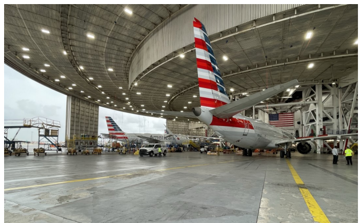
Left Photo: U.S. DOT OSDBU meets with small business firms to talk about women in transportation-related careers. Right Photo: Miami International Airport hangar during a WITI tour with local high school students.