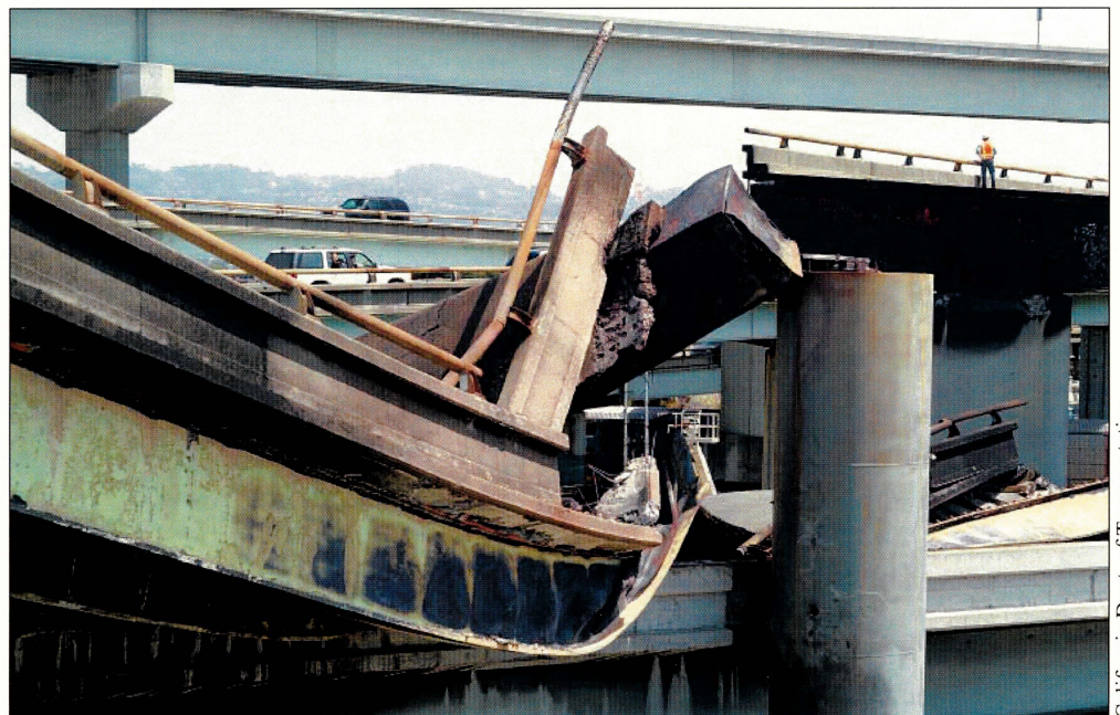
California Dept. of Transportation

Reminiscent of the intense heat generated from burning aviation fuel that ultimately led to the collapse of New York City's Twin Towers, the crumpling of this Oakland California interchange, which resulted from the crash and explosion of a fuel truck, prompted the NTSC study.