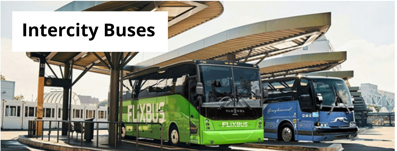
Intercity bus terminal.

Intercity buses bridge critical transportation gaps in rural areas, between urban centers, and during high traffic periods, by offering sustainable, accessible, and convenient travel options.