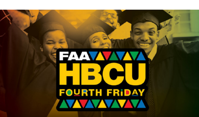
REP YOUR SCHOOL

Nearly 350 registrants attended the inaugural One-DOT Summit held on the campus of South Carolina State University in September. The One-DOT Summit served as an opportunity for students and administrators from HBCUs in South Carolina to learn, discuss, and network around education, careers, research, technology, and partnership opportunities with the Department of Transportation as we seek to accelerate inclusive and equitable access. This two-day summit produced as a collaborative experience between the South Carolina State University (SCSU) Institute for Business, Environment, Communications and Transportation (BECT), the Federal Motor Carriers Safety Administration (FMCSA) Operating Administration featured remarks from Congressman James Clyburn, and several stakeholders within DOT.