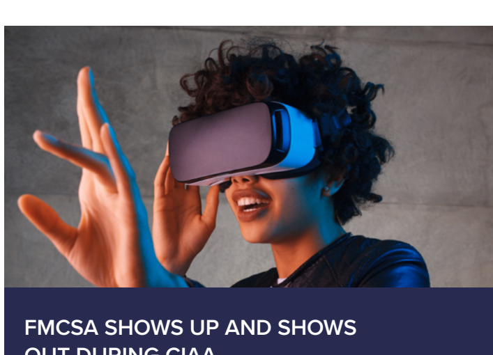
FMCSA SHOWS UP AND SHOWS OUT DURING CIAA

The CIAA Tournament is one of the premier athletic events across the HBCU landscape, and 2024 was no different. To grow awareness, engagement, and consideration from high school and college students, FMCSA staff attended events throughout the week, including conducting a roadshow with each school and attending the Central Intercollegiate Athletic Association Conference career fair. During the career fair, staff provided information about career opportunities and allowed attendees to experience their new Virtual Reality (VR) goggles. The VR goggles gave attendees an immersive experience of what it's like being in the cab of a large truck navigating blind spots, and provided examples of how other vehicles should safely maneuver and share the road.