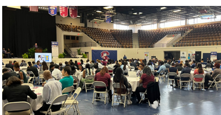
GROUNDBREAKING SCSU ONE DOT SUMMIT SERVES AS A CATALYST FOR CHANGE

The U.S. Department of Transportation's Federal Transit Administration (FTA) announced Alabama A&M University's Bulldog Transit System will receive $8.1 million in grant funding for upgrades, facility expansions, solar energy storage, and other projects. The grant will help the AAMU transit system transition to zero emissions. Of the 130 awards totaling nearly $1.7 billion from President Biden's Bipartisan Infrastructure Law, AAMU was the only Alabama awardee.