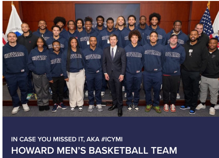
IN CASE YOU MISSED IT, AKA #ICYMI HOWARD MEN'S BASKETBALL TEAM

The plan signals a necessary culture shift and is now underway.