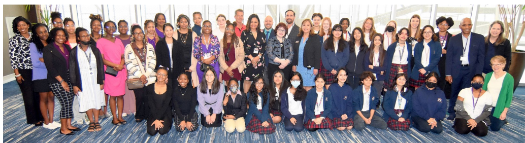
The Gulf Region's SBTRC WITI Program: Aviation Careers & World of Drones was held in Irving, TX, where 45 students from local schools learned about WITI internship opportunities and careers with an emphasis on drone pilots and the Dallas-Fort Worth (DFW) International Airport.

Additionally, the Gulf SBTRC hosted a dynamic Women In Transportation Initiative (WITI) Program event, “Aviation Careers & World of Drones.” Two local area schools of young girls from middle and high schools participated in the event to learn about transportation careers and opportunities to engage in transportation-related initiatives from a variety of professionals.