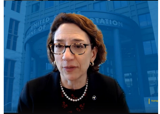
DOT Secretary Pete Buttigieg provides welcome remarks and DOT Deputy Secretary Polly Trottenberg provides closing remarks at the OSDBU hosted Women's Wednesday event.