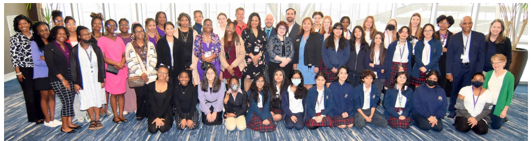
The Gulf Region's SBTRC WITI Program: Aviation Careers & World of Drones was held in Irving, TX, where 45 students from local schools learned about WITI internship opportunities and careers with an emphasis on drone pilots and the Dallas-Fort Worth (DFW) International Airport.

Additionally, the Gulf SBTRC hosted a dynamic Women In Transportation Initiative (WITI) Program event, "Aviation Careers & World of Drones." Two local area schools of young girls from middle and high schools participated in the event to learn about transportation careers and opportunities to engage in transportation-related initiatives from a variety of professionals.