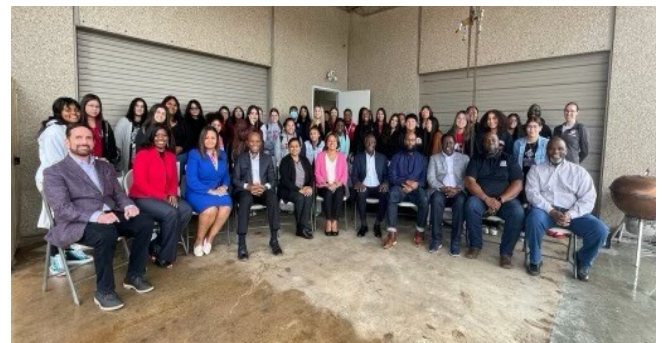
High school girls participated in the "World of Drones" WITI event hosted by Gulf region SBTRC engaging with industry DBE firms and US DOT officials.