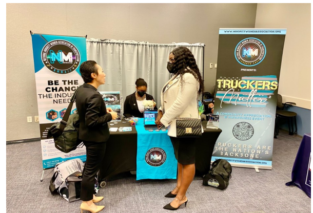
Small businesses meet with transportation primes and stakeholders at the Business Forum 2022 event.

The afternoon portion was dedicated to the Connections MarketPlace (CMP) which included one-on-one business matchmaking, an interactive Stakeholder EXPO, and Access to Capital sessions in partnership with the Small Business Administration. During the one-on-one meetings, small businesses were matched with large primes, US DOT modal business specialists, Small Business Investment Companies (SBICs), Community Development Financial Institutions (CDFIs), and transportation stakeholders to build connections and learn more about contracting opportunities, financial and technical assistance, and other resources.