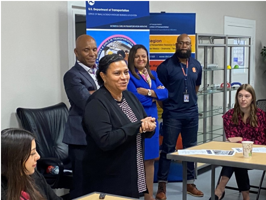
DBE business owner speaks to young women at Gulf Region WITI event about career pathways.