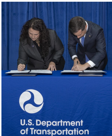
SBA Administrator Guzman and U.S. Secretary Buttigieg sign MOU at Business Forum 2022 on September 20.