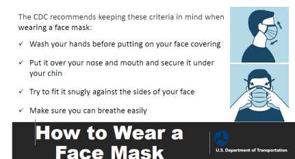
Typical TV display at ground floor elevator entrances