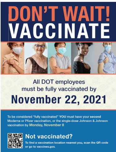
Building notice signs at elevator lobbies on all floors