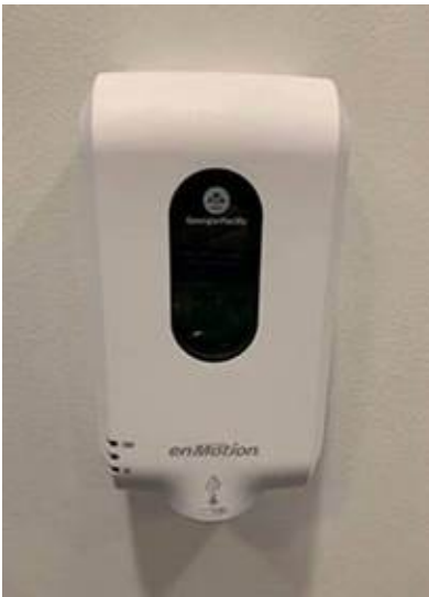
Wall mounted hand sanitizer stations in all elevator lobbies above the ground floor

Note: Similar equipment and signage may be found at other DOT-occupied facilities.