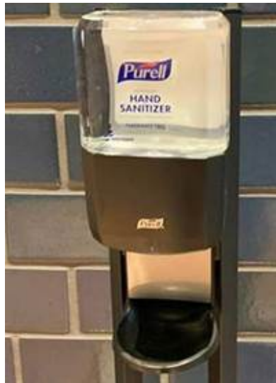
Freestanding sanitizer stations in the shuttle elevators and ground floor elevator lobbies