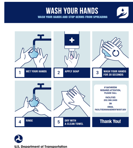
Sign in restroom and pantry sinks on all floors