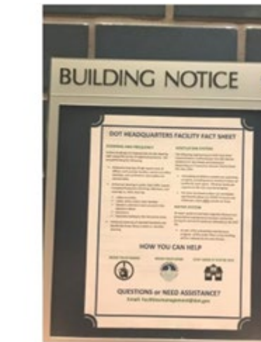
Building notice signs at elevator lobbies on all floors