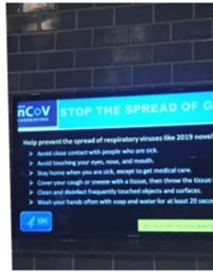
TV display on Ground Floor Elevator entrances