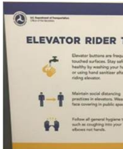
Sign at all elevator lobbies on all floors