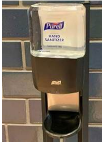
Freestanding Stations in the Shuttle Elevators and Ground Floor Elevator lobbies