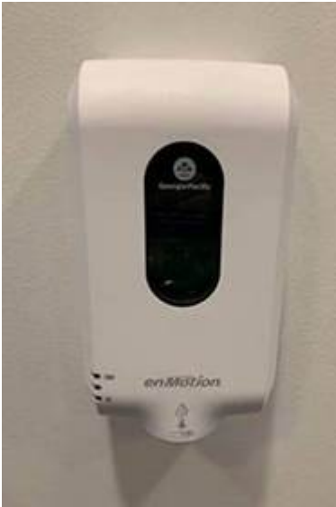
Wall Mounted Hand Sanitizer Stations in all elevator lobbies above the ground floor