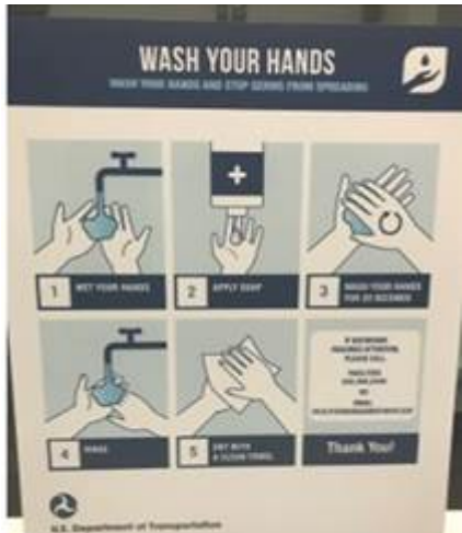
Sign in restroom and pantry sinks on all floors