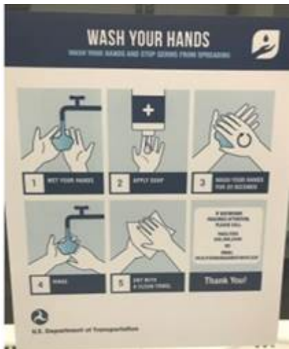
Sign in restroom and pantry sinks on all floors