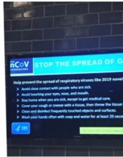
TV display on Ground Floor Elevator entrances