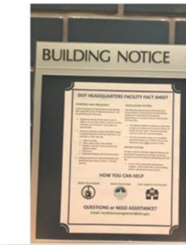
Building notice signs at elevator lobbies on all floors