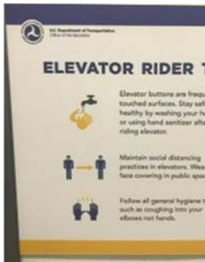
Sign at all elevator lobbies on all floors