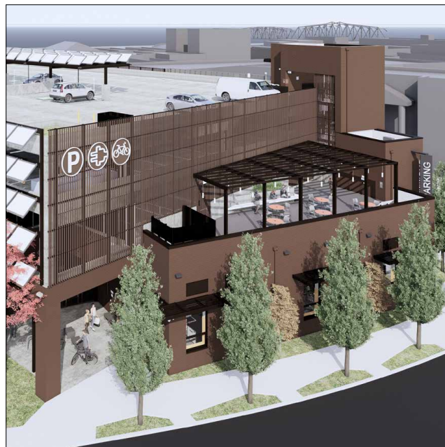
Rendering of the Mount Vernon Library Commons Project from the southeast corner (Image: HKP Architects).

Mount Vernon is the most populous city in Skagit County, Washington. Located one hour north of Seattle, Mount Vernon is home to over 35,000 residents with a median age of 35 years old. The median household income in the city is $69,227 (as of the 2020 U.S. census).