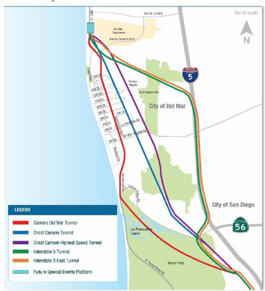
Figure 5 – Potential Future Realignments of LOSSAN Rail Corridor in City of Del Mar

Enhance long-term efficiency, reliability, and cost in the movement of people and goods